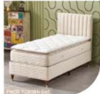
Pedli Yataklı Set