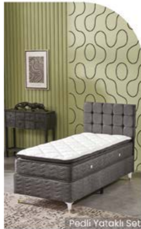
Pedli Yataklı Set