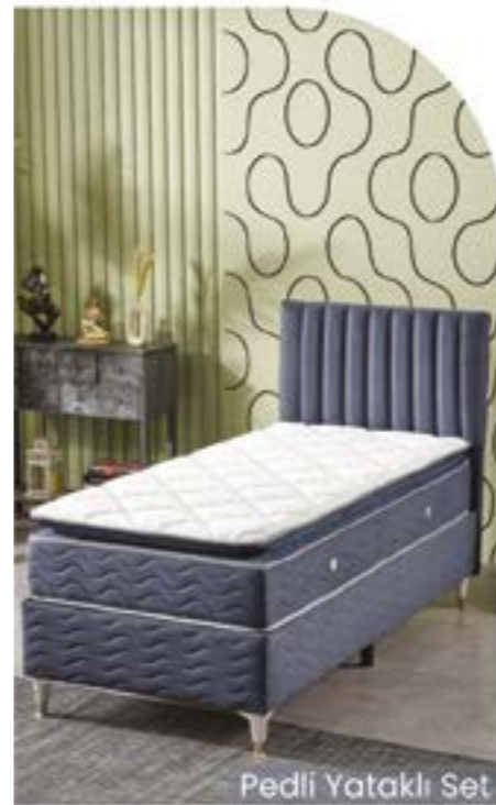
Pedli Yataklı Set