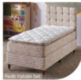
Pedli Yatoki Set