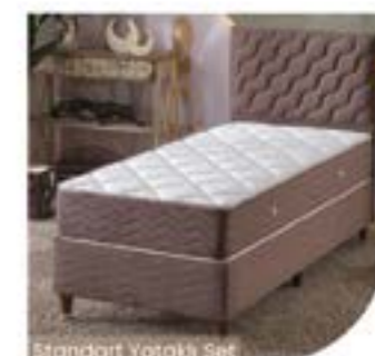
Standart Yataki Set