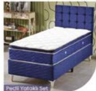
Pedli Yatoki Set