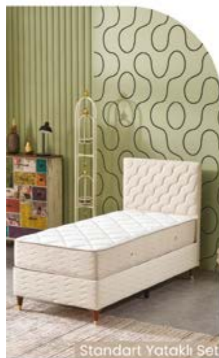
Standart Yataklı Set