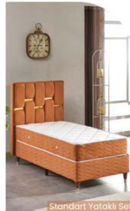
Standart Yataklı Set