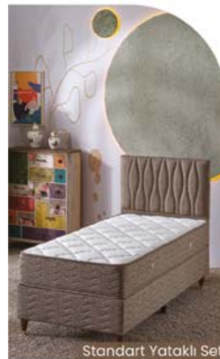
Standart Yataklı Set