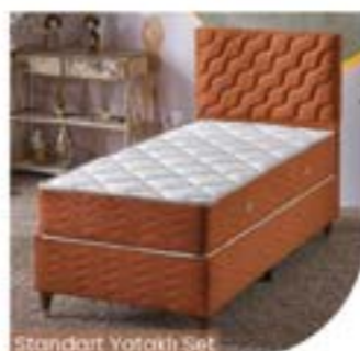
Standart Yataki Set