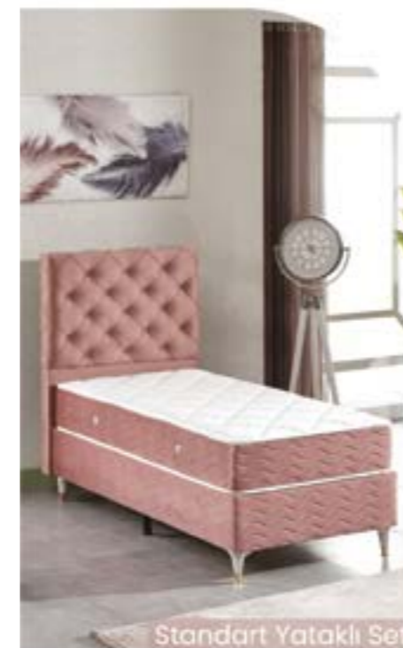
Standart Yataklı Set