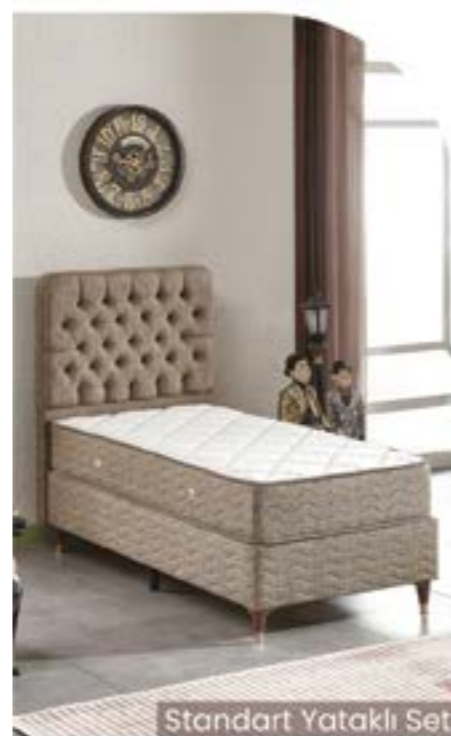
Standart Yataklı Set