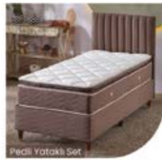
Pedli Yataklı Set